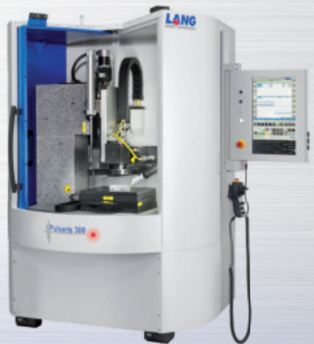
Pulsaris 300 Laser Engraving Machine